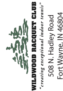
2018 Summer Calendar